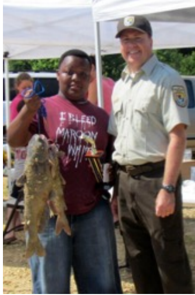
Early Fishing Derby events had prizes, the trophy here for largest fish in age-group category