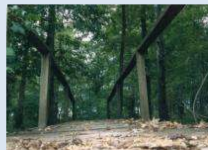
Bridge to Adventure Benjamin Knight Third Place