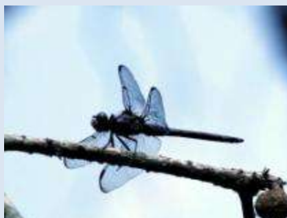
Dragon Fly in Blue Kylee McMullen Second Place