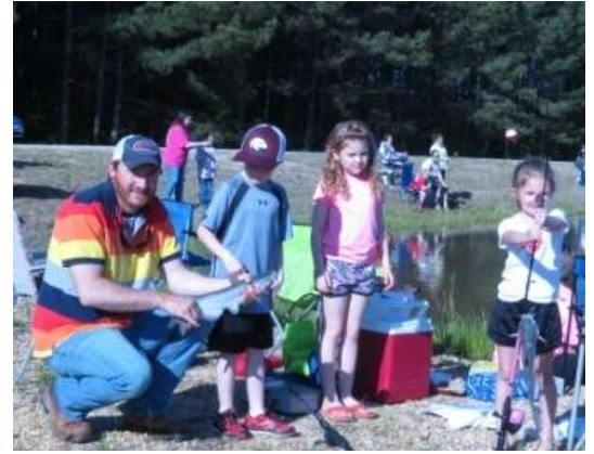
It was a good day for fishing.