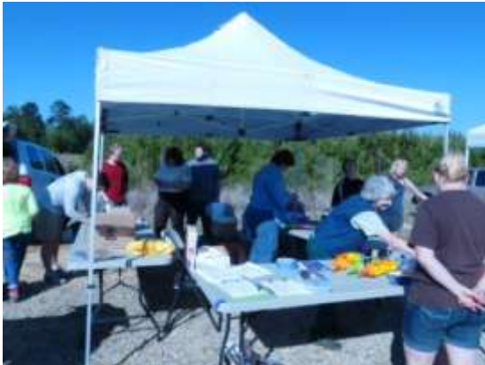
Everyone gets a prize at the Fishing Derby, thanks to Louisville Walmart and FoNR.