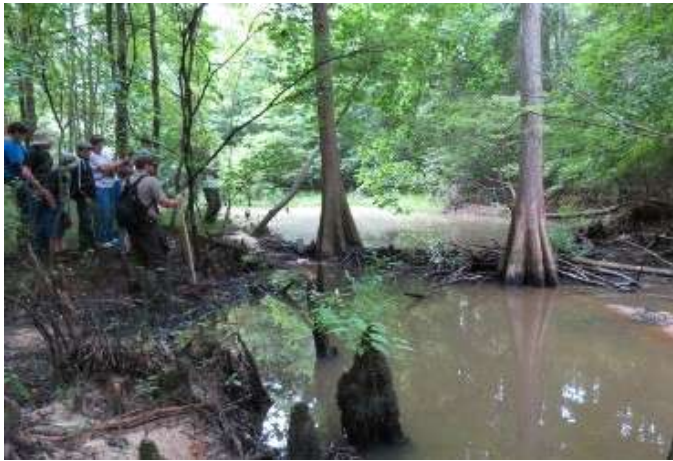
Waterway is blocked by beaver