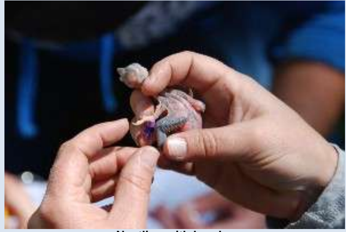
Nestling with bands.

With the ladder secure and a safety belt attached, Caroline checked the cavity for babies, snakes or squirrels with a small mirror. Finding only nestlings, Caroline made a loop of a thin plastic string, inserting it into the cavity, carefully lassoing one of the nestlings. She retrieved each nestling from the cavity with the lasso, placing it in a small soft bag. Holding the handle of the bag with her teeth, she climbed down the ladder.