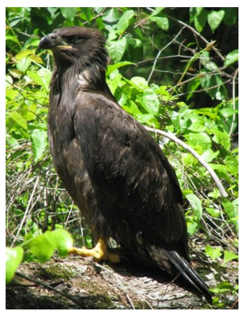
Lucky in his immature plumage

According to Richardson, eagles nest in the winter with incubation taking more than 30 days. After hatching, eaglets stay in the nest 10-12 weeks prior to flying on their own. The triplets hatched in late January or early February, making them 7-9 weeks old when disaster struck.